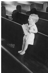
To You Who Bring Small Children to Church: